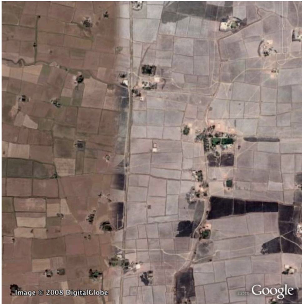
Satellite image of settlements before cyclone Nargis struck on 3rd May 2008