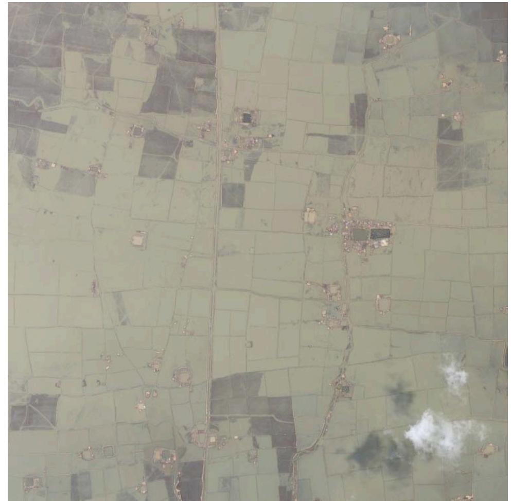
Satellite image taken 7th May 2008 showing extensive flooding after cyclone Nargis