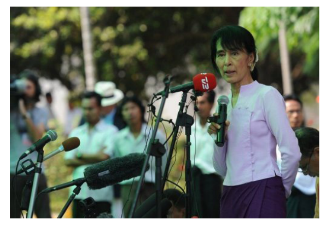
Aung San Suu Kyi speaking at the NLD press conference on 31 March.

The National League for Democracy and other parties have highlighted numerous cases of unfair practices, including problems with voter lists, banning of election rallies, censorship, voter intimidation and bribery.