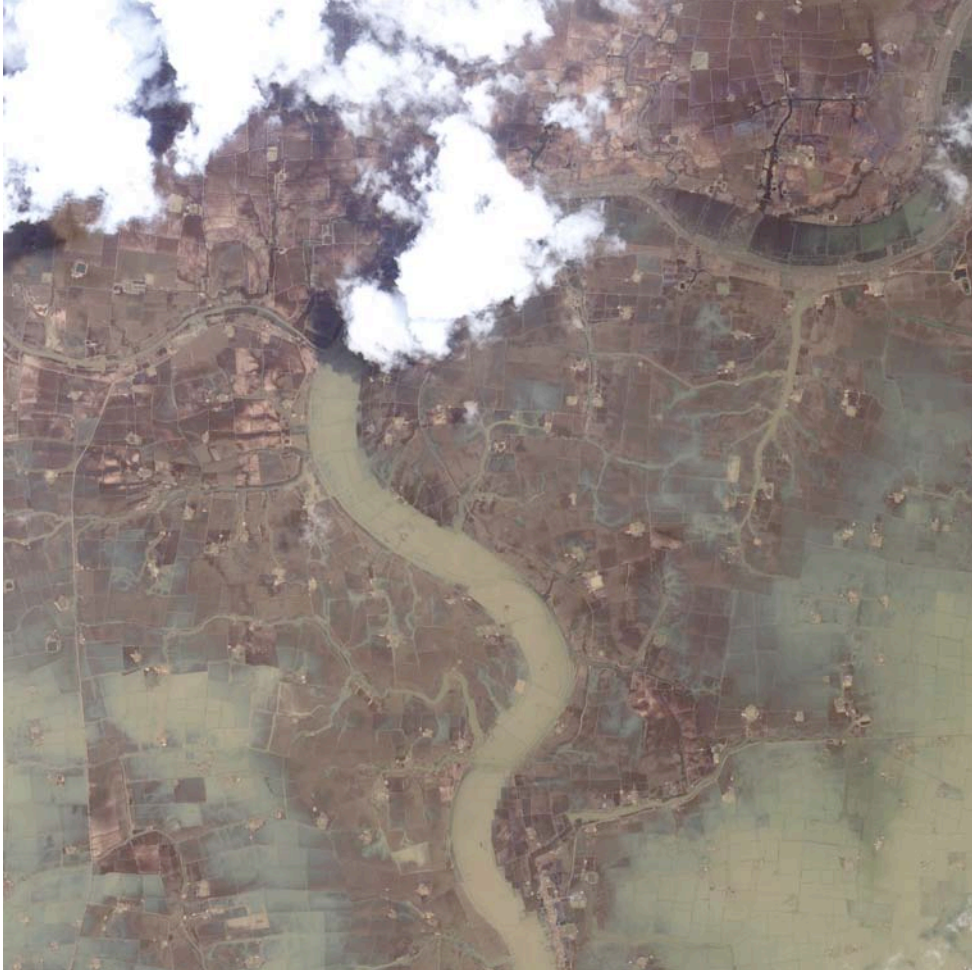
Satellite image taken 7th May 2008 showing flooding caused by cyclone Nargis